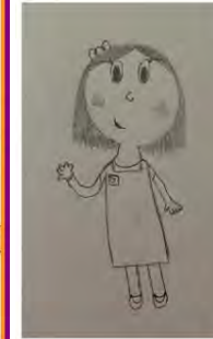
QUEEN WHINNIE (FLEX FOX)