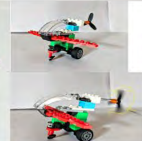
Mini Propeller Powered Plane