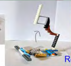
Ready to fly