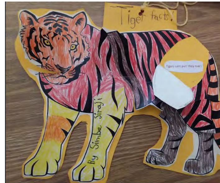
Simba's Flap Book on Tigers